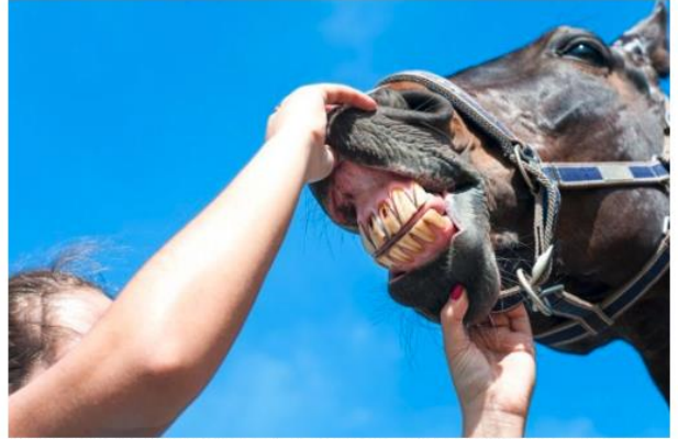
When were your horse's teeth last checked?

Then our older horses may need their teeth checked more frequently so that they can get the most value from their food, and in all age ranges more frequent check-ups are warranted in any of the following situations: